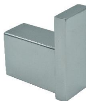
AI1418C Bright finish