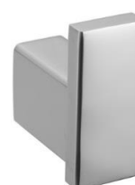
AI1418CS Satin finish